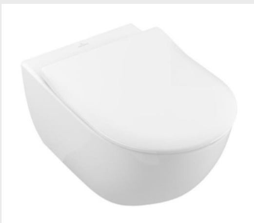
WC Subway Toilet seat soft close