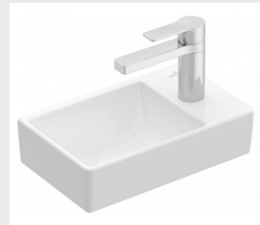
Washbasin Avento 36 x 22 cm