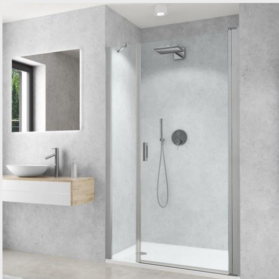
Shower door ROHT CI FX0 + CI PIG