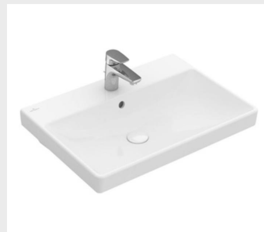
Sink Avento 60 x 47 cm