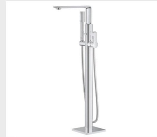
Bath faucet GROHE Allure New (apartment 9th floor)