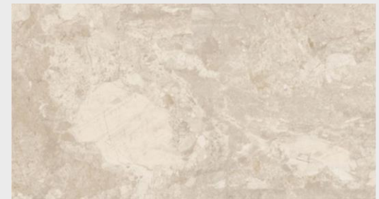
Mun beige mat