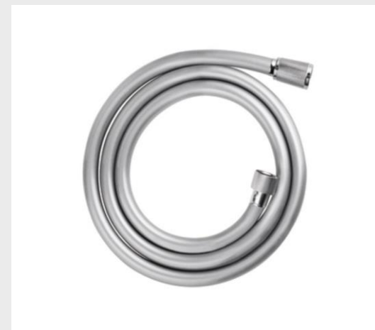
Shower hose GROHE Rotaflex 150 cm