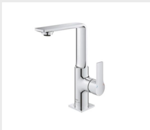
Sink tap GROHE Allure New, vol. L