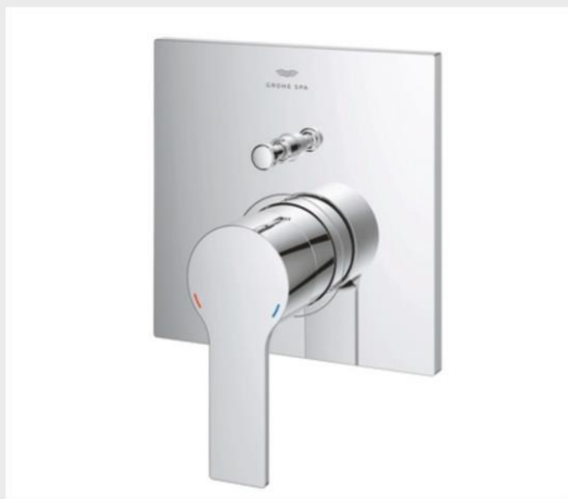
Bath faucet GROHE Allure New