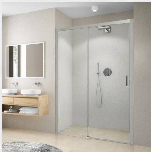
Shower door ROHT CI D2L / D2R (apartment 704)

ROTH niche shower door Design: sliding or hinged, with or without a fixed segment, clear glass