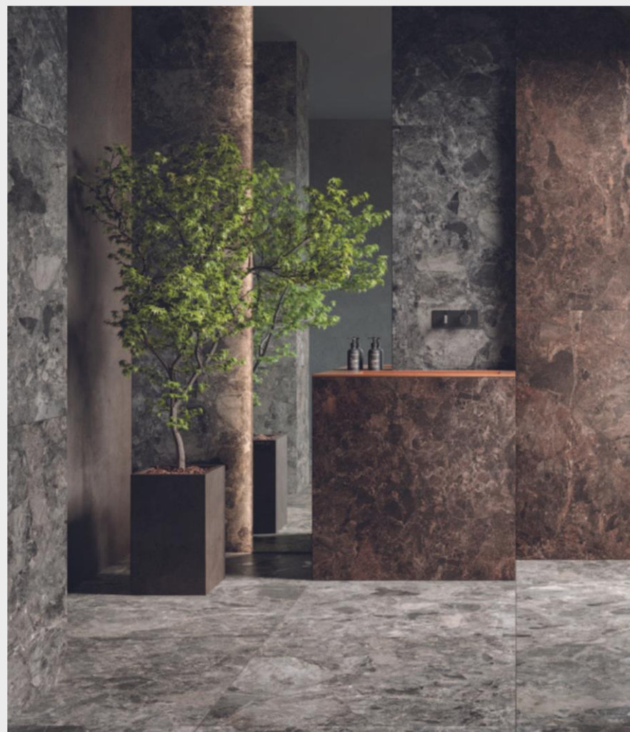
Mun rust a Mun dark

*Units 704, 801 and 901 will have tiles in all rooms.