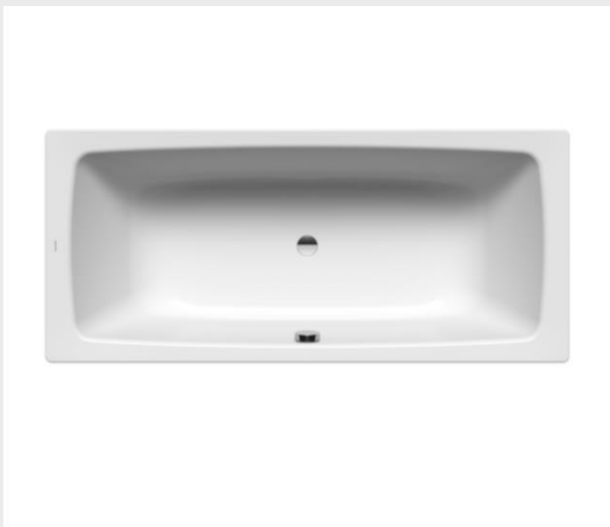
Bath KALDEWEI Cayono Duo 175 x 75 cm (apartment 2nd to 8th floors)

The combination of timelessly elegant design and noble material in the form of durable enameled steel guarantee the products of the German manufacturer worldwide popularity.