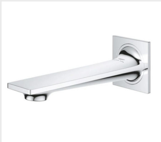
Bathtub drain GROHE Allure New