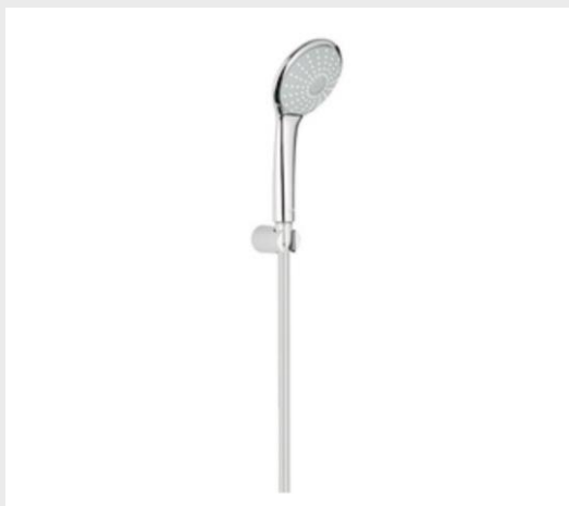
Head shower GROHE Euphoria

GROHE faucets Exceptional design, perfectly balanced proportions and technical excellence that guarantee unrivaled performance.