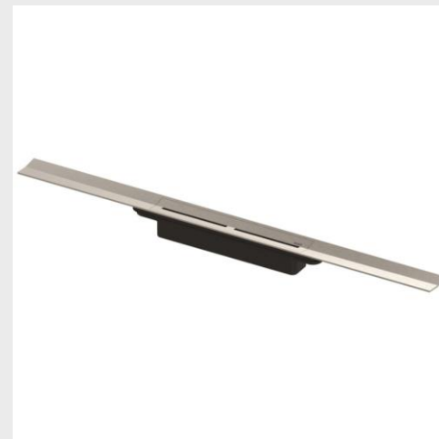
Shower drain TECE drainprofile