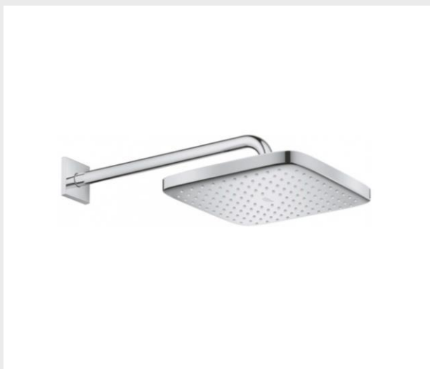
Head shower - tropical rain GROHE Tempesta 250 Cube