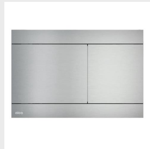
Flush button ALCA Fun Alunox