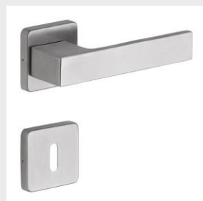
Forging ROSTEX Ravena