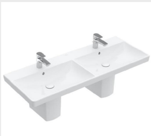
Double sink Avento x 47 cm 120