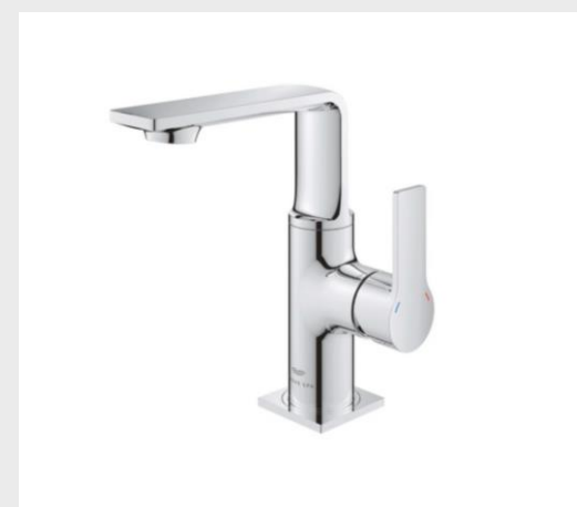
Sink tap GROHE Allure New, vol. M