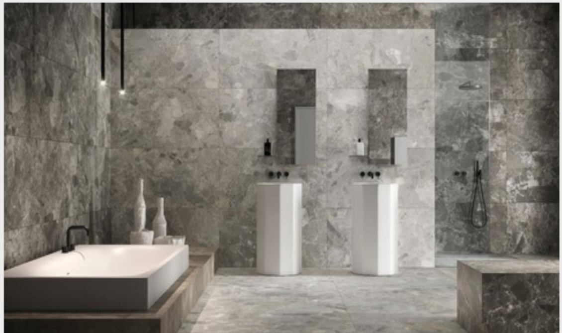
Mun grey mat in the interior

*Units 704, 801 and 901 will have tiles in all rooms.