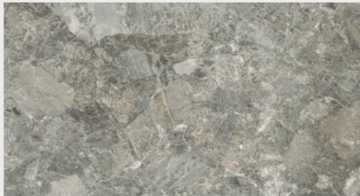
Mun grey mat

Mun beige mat decor will be in the units on the 2nd, 4th and 6th floors