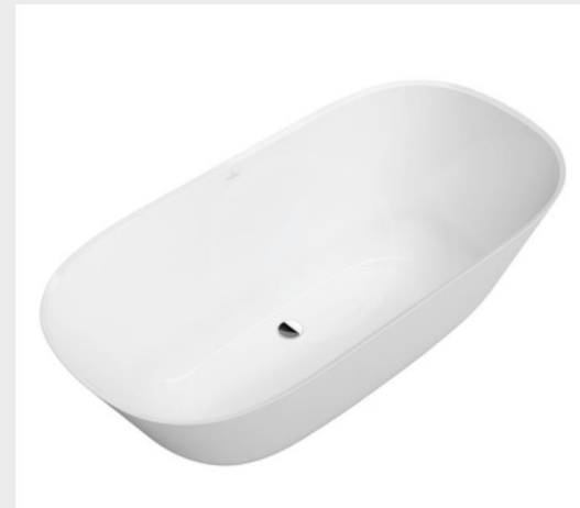
Freestanding bathtub VILLEROY & BOCH Theano, 175 x 80 cm (apartment 9th floor)