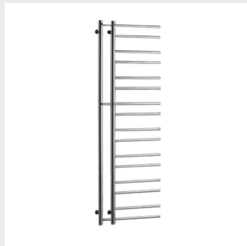
Heating ladder PMH Theia